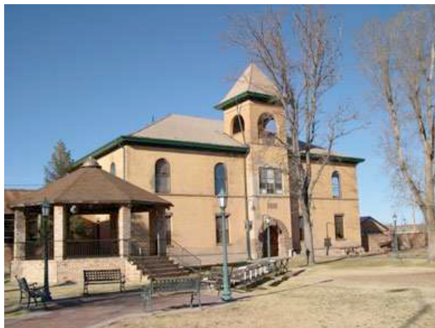
Figure 2. Navajo County Historical Museum.