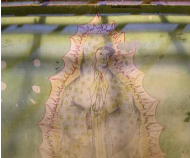
Figure 8. Drawing of the Virgin of Guadalupe on prison wall, Navajo County Museum. (Anonymous artist; Photograph: Author.)

This museum tells a brief history of Holbrook and the surrounding area. People from Mexico and Mormon Pioneers settled the Little Colorado River Valley. With plenty of water, lush grasslands, centrally located between the Hopi and vast Navajo Indian Reservations to the north, Fort Apache to the south, and the beautiful Petrified Forest to the east, it soon became the center of commerce when the railroad arrived in 1881. Shown in display cases are pottery, baskets, and rugs used by the three Indian tribes, and items used by early Mexican settlers. 17