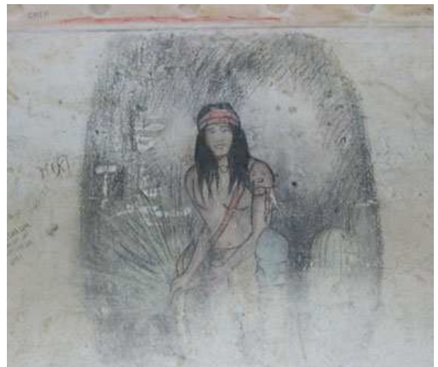
Figure 7. Drawing on prison wall, Navajo County Museum. (Anonymous artist)

these populations as if from the distant past, and from the exhibit’s main narrative, that concerns us here. This segregation is reinforced by the official museum brochure, which summarizes the local past as follows: