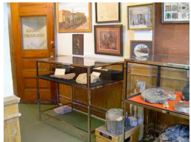
Figure 3. "Prehistory." Detail of exhibits, Navajo County Museum.

The next set of rooms displays the dwellings, stores, and material culture of local "pioneers," ancestors of the museum's founders. We see a recreated drug store, kitchen, barbershop, saloon, and a pioneer bedroom. The brochure instructs us, "Moving across the hall you will find a pioneer kitchen showing the washing machine that was such an improvement over