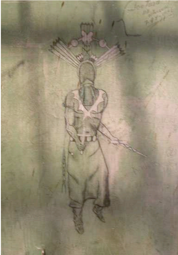
Figure 5. Drawing of Apache Crown Dancer on prison wall, Navajo County Museum. (Anonymous artist)

1985; Leone and Little 2004). The “natural history” model, which situates native peoples in a liminal place between nature and culture, was the dominant exhibitionary paradigm for ethnographic displays in the late 19th and much of the 20th centuries. As Tony Bennett (1995:185–187) has argued, this is an exhibitionary environment that is simultaneously a performative one as the visitor travels through an “irreversible succession” of evolutionary stages. The Holbrook visitor makes such a journey, traveling from primitive inland seas and their early plant and animal creatures, past ancient native artifacts, through stages of early “human” history involving livestock thievery and lawlessness, and culminating in what could be viewed as the apex of civilization, the court of law with its display of an early American flag.