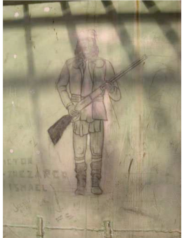
Figure 6. Drawing of Geronimo on prison wall, Navajo County Museum. (Anonymous artist; Photograph: Author.)

In what ways is the evolutionary framework motivated by the logic of settler colonialism? It could be argued that the museum is ethnically inclusive in that it acknowledges the town’s indigenous and Hispanic past in its very first displays. It is in the segregation of